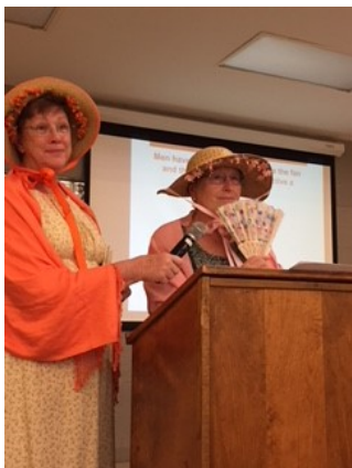
Jane Austen and her sister Cassandra explain the language of fans.