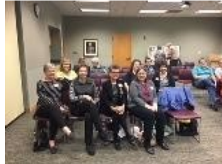
Quite the crowd at the Northville District Library.