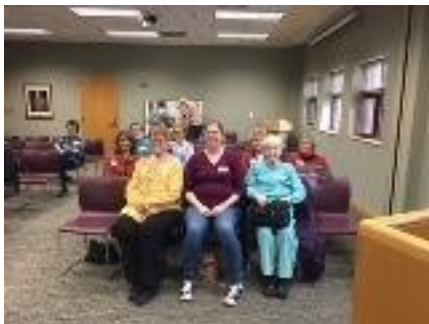
Thanks for bringing your guests!