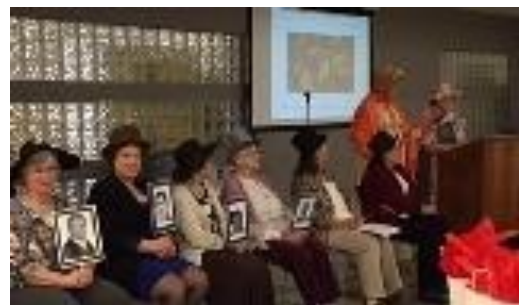
Jane Austen’s six leading men compete for her rose. Mr. Darcy is the winner.